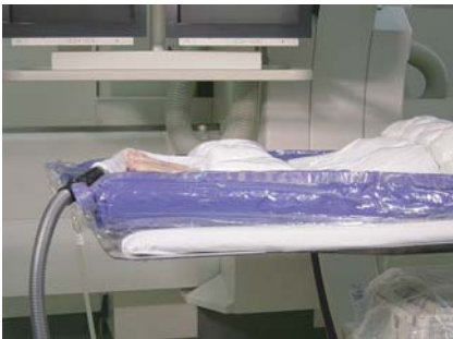
Entire Body Immobilization